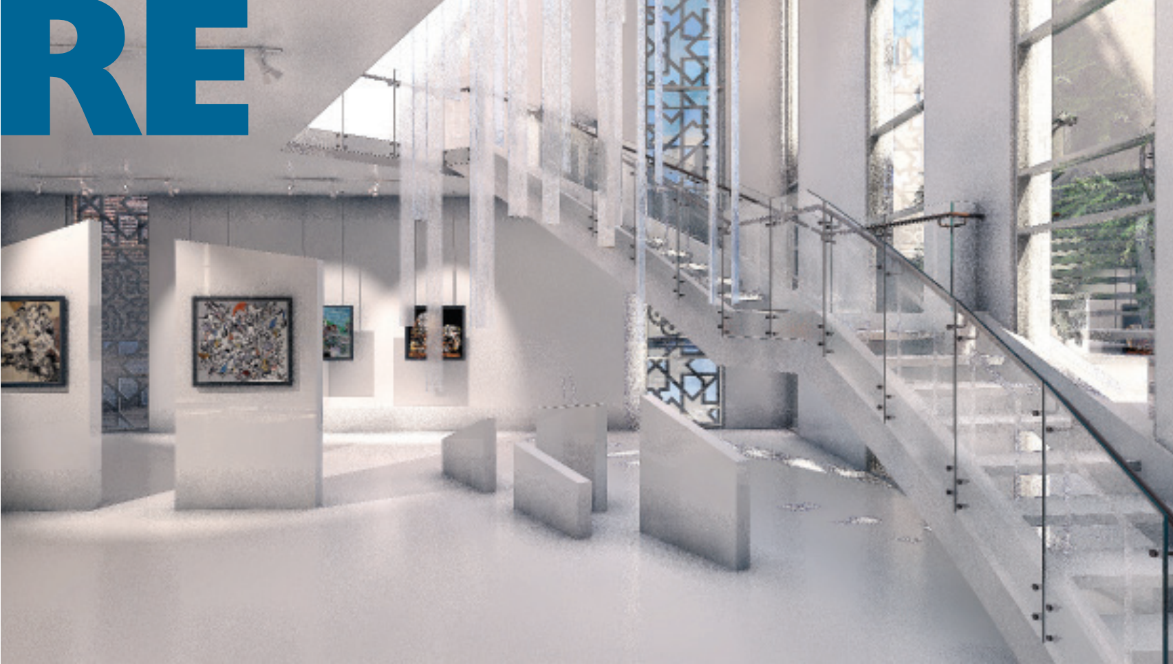
Right: The vision for the interior of MEI’s contemporary art gallery